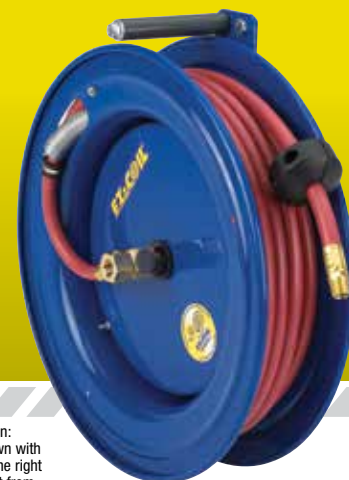
Reel Orientation: Right Mount is shown with mounting base on the right side & hose payout from the top of the reel